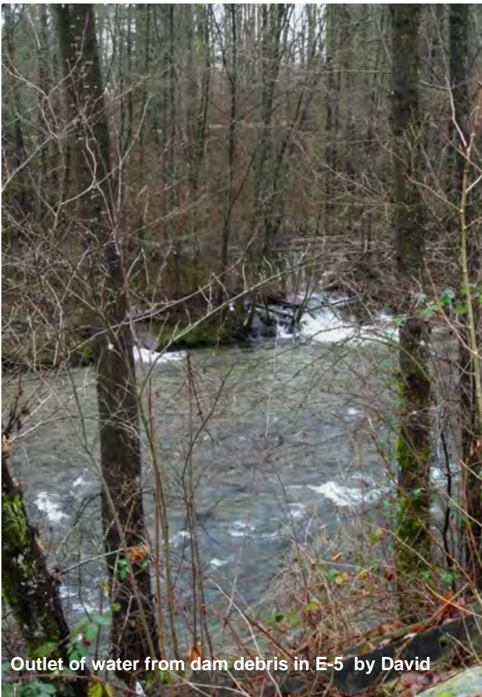
Outlet of water from dam debris in E-5 by David

It was a nice sunny day but quiet. Two people at McTavish Park were sitting and enjoying the day and watching the river. There were cigarette packages at the foot of Hockaday and potato chip bag on the river trail. Otherwise, the reach was pretty clean. The River was running nice and clear. Birds included thrushes, flickers, starlings, crows, two Mallards, and lots of juncos. There was a swarm of Bushtits and an Eastern Grey squirrel was spotted. Another perfect day to be outside - sunny but cool. Not much has changed to my untrained eye along this stretch for several months. Even the weather has been consistently good. A washout of a portion of the debris island behind McTavish Park is continuing. It's a slow process that has been happening for over a year.