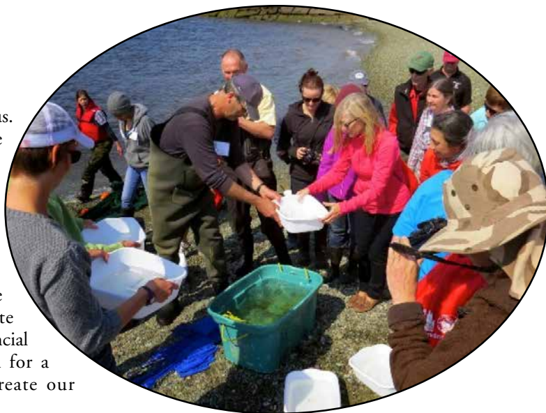
The workshops were "rain or shine", and we were glad that it was mostly "shine".

Next morning, after a great breakfast catered by Carmoors Cookery, the learning began. For those new to salmon enhancement, there were sessions on how to get started, while others provided in-depth information for experienced enthusiasts. Session titles included Aquatic Invertebrate Studies, Egg to Fry, Fry to Release, First Nations Programs that Work, Riparian Restoration, Salish Sea Marine Survival Program, Watershed Roundtable, Adult Broodstock, Digital Camera How-to, Early Marine Survivals, Fish Dissection, Fisheries Protection Program, NGOs, Stock Assessment, Stream Restoration, DNA Tagging, Engaging Volunteers,