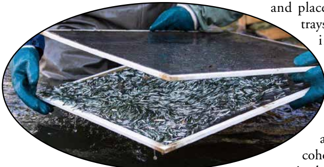
Look out, Englishman River! Here come 800,000 feisty pink fry!